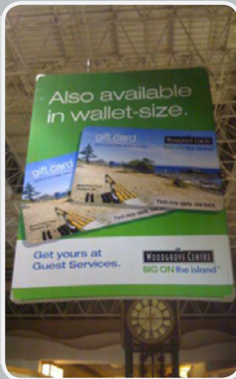
9 W x 12' H Mall Banner