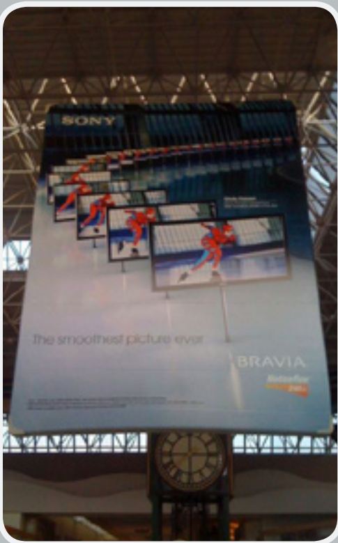
9 W x 12' H Mall Banner