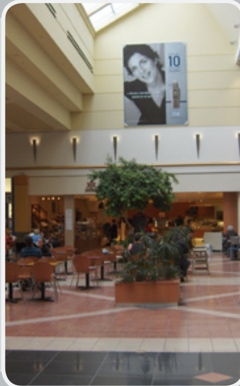
9' W x 12' H Mall Banner (Single Sided)