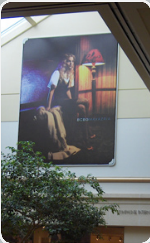
9' W x 12' H Mall Banner (Single Sided)