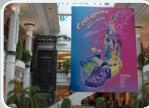
12' W x 16' H Mall Banner