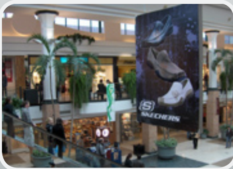
9' W x 12' H Mall Banner