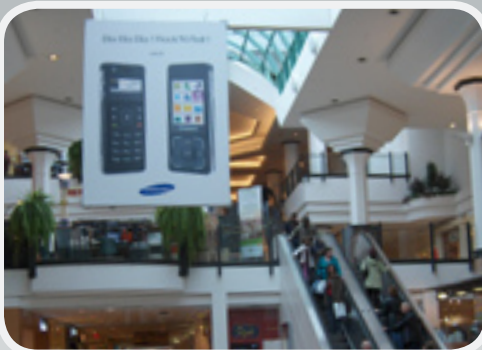
9' W x 12' H Mall Banner