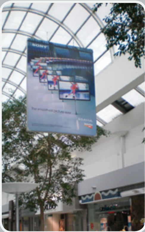
9 W x 12' H Mall Banner