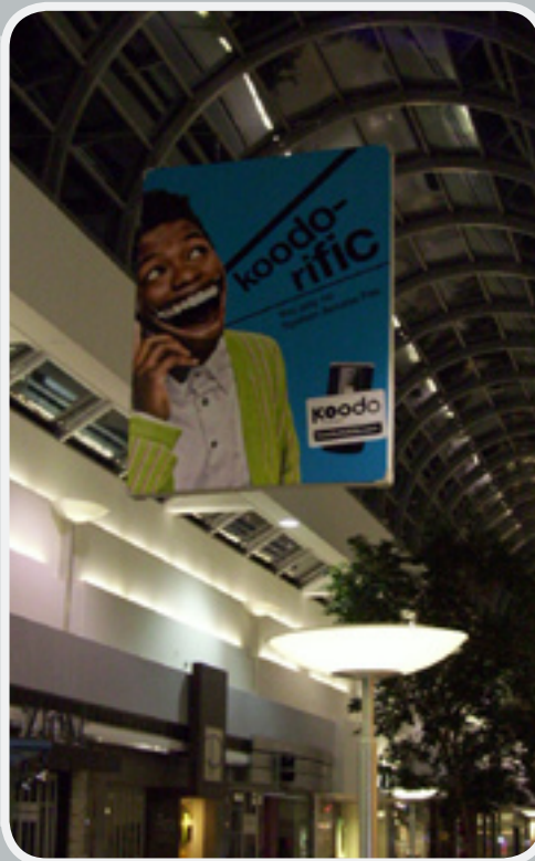
9 W x 12' H Mall Banner