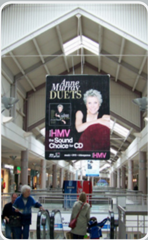
12' W x 16' H Mall Banner