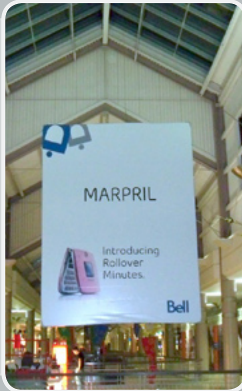
12' W x 16' H Mall Banner