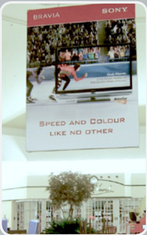
12' W x 16' H Mall Banner