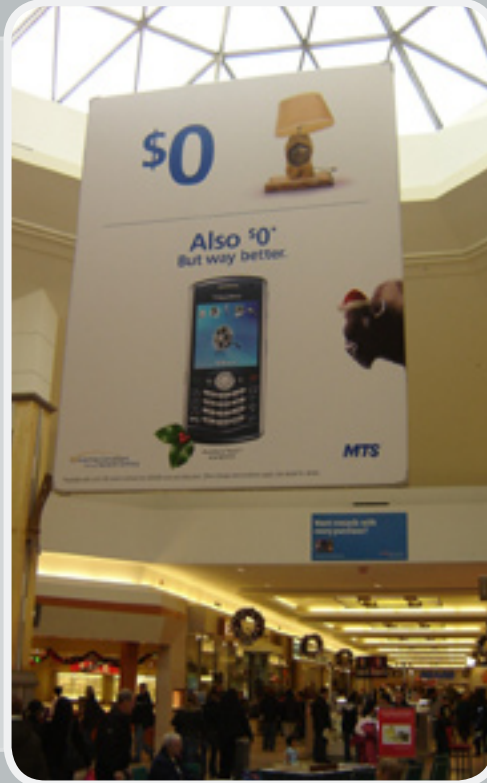
12' W x 16' H Mall Banner