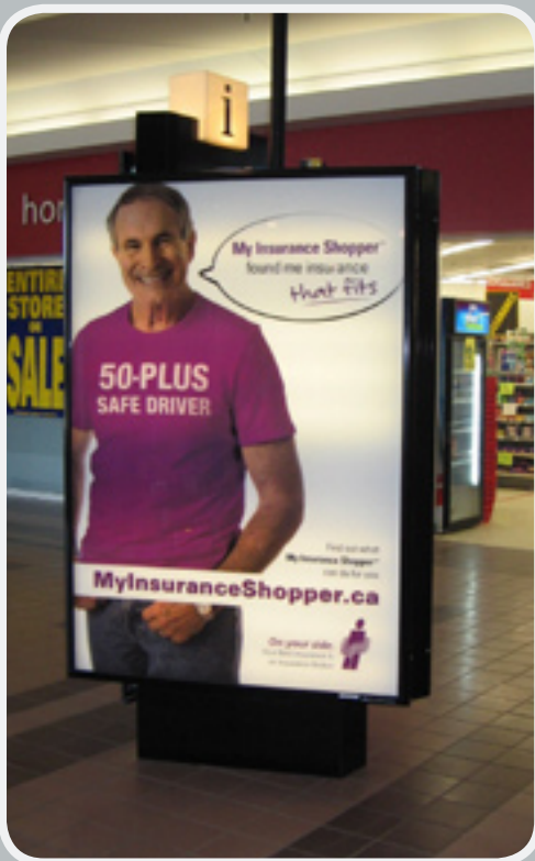
4' W x 6' H Mall Poster