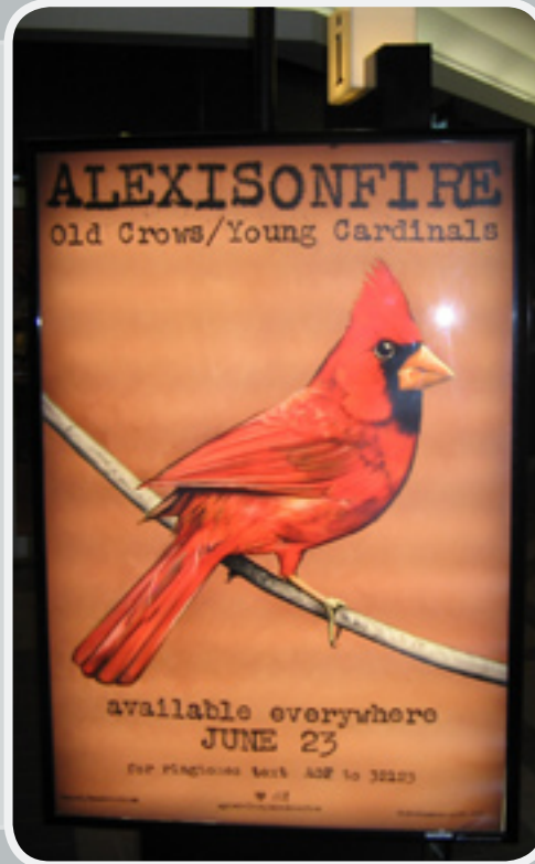
4' W x 6' H Mall Poster