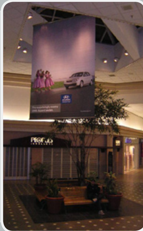
9' W x 12' H Panomax Mall Banner