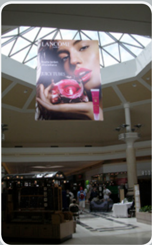
9' W x 12' H Panomax Mall Banner